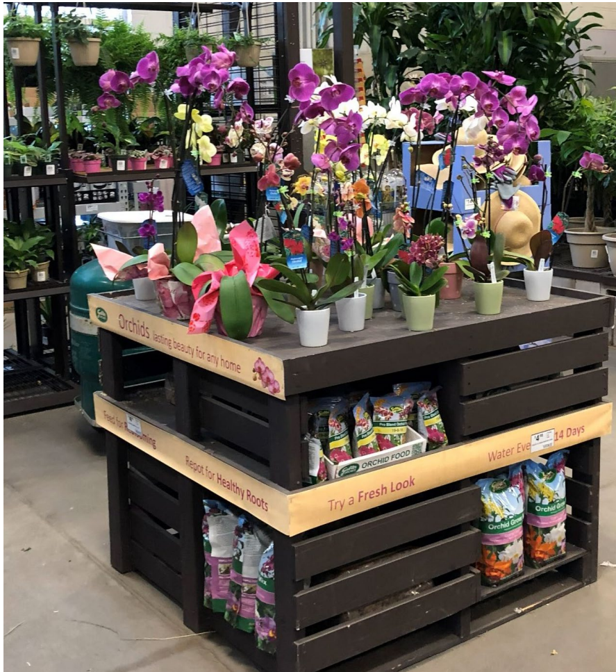
Orchid Inventory too light.